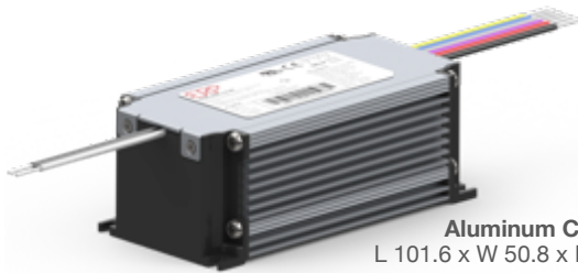
Aluminum Case L 101.6 x W 50.8 x H 38.5 mm (L 4 x W 2 x H 1.52 in)