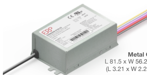
Metal Case L 81.5 x W 56.2 x H 31.5 mm (L 3.21 x W 2.21 x H 1.24 in)