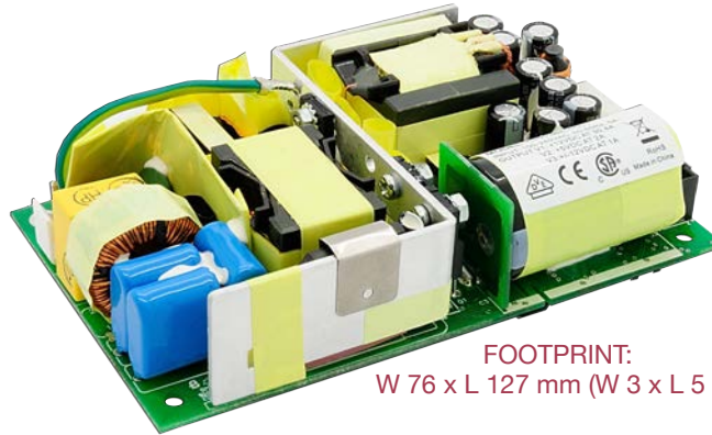
FOOTPRINT: W 76 x L 127 mm (W 3 x L 5 in)